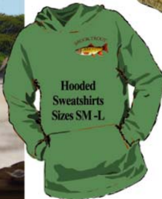
Hooded Sweatshirts Sizes SM - L