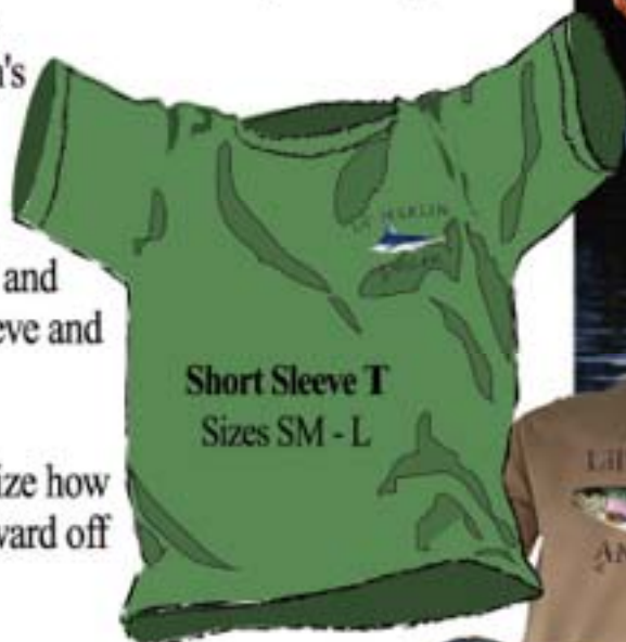
Short Sleeve T Sizes SM - L