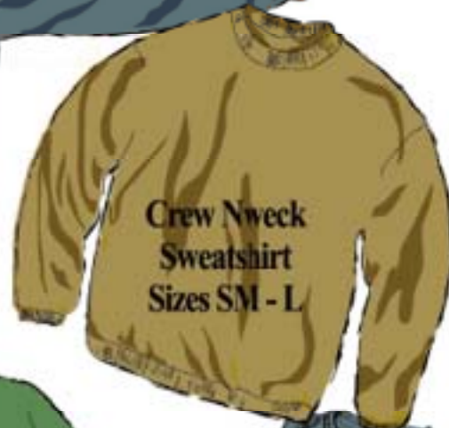
Crew Neck Sweatshirt Sizes SM - L