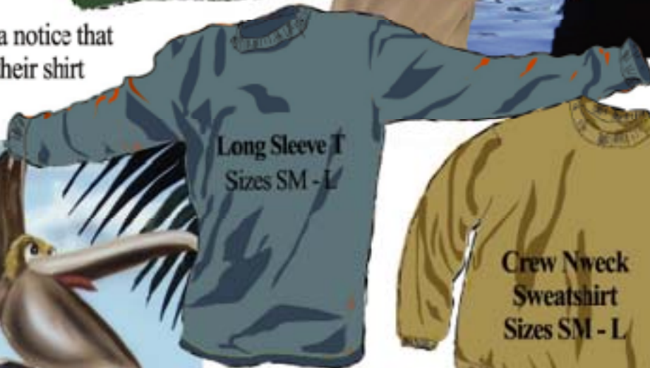
Long Sleeve T Sizes SM - L